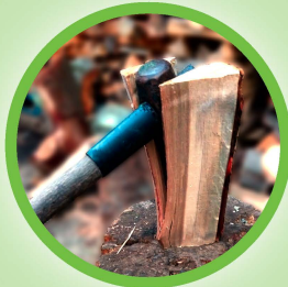
Split the wood