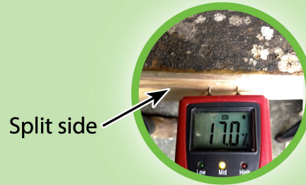
Test the newly split side